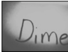
2) I am on something that can grow.