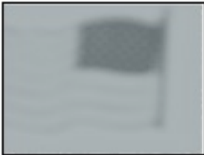
1) I am for one of the teams