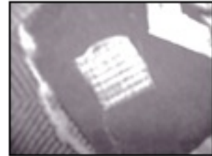
3) On a wall...